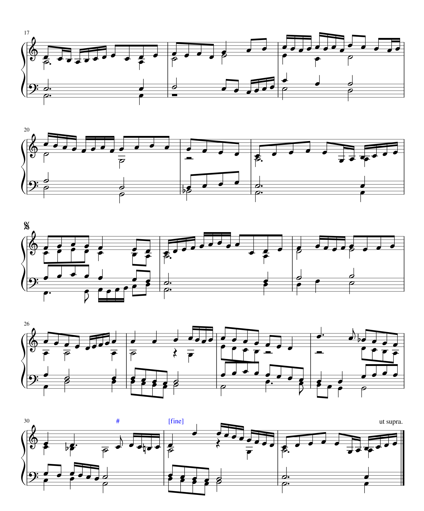
Typeset: Chad Goerzen 2017: cc by 4.0