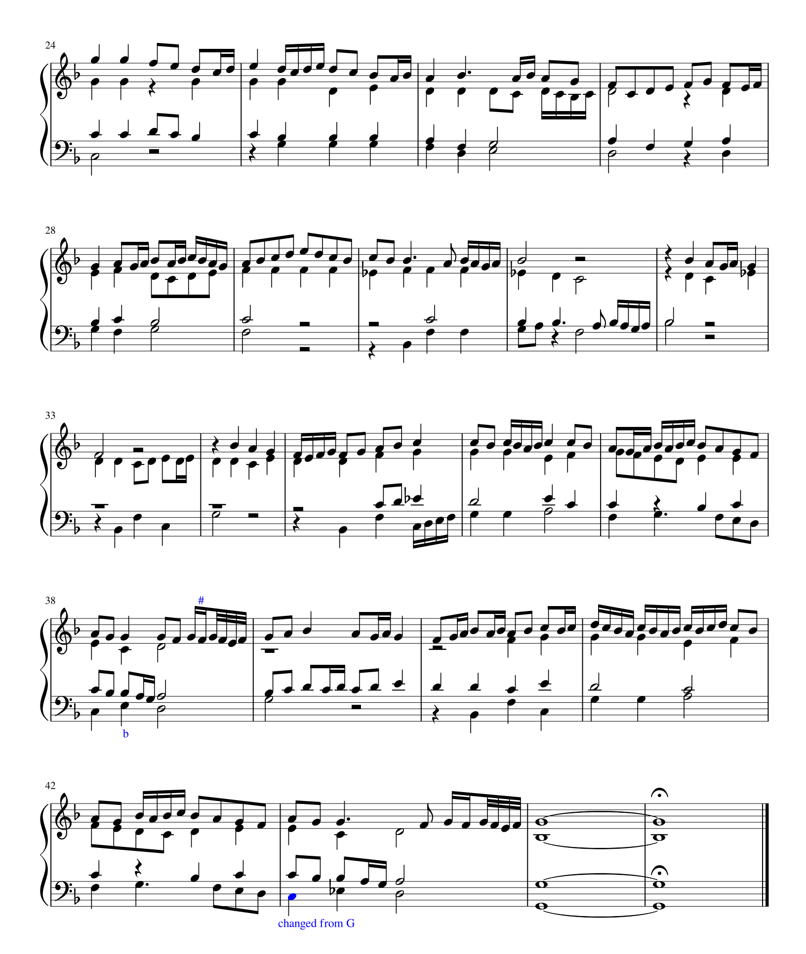
Typeset: Chad Goerzen 2017: cc by 4.0