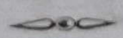
FIGURE DE LA POULE.

Traversez deux en donnant la main droite a la Dame de vis a vis, Retraversez en donnant la main gauche, Balancez quatre en donnant la main droite, Demie queue du chat, En avant deux, Dos a dos, Demie chaine anglaise. Contre partie pour les 6 autres.