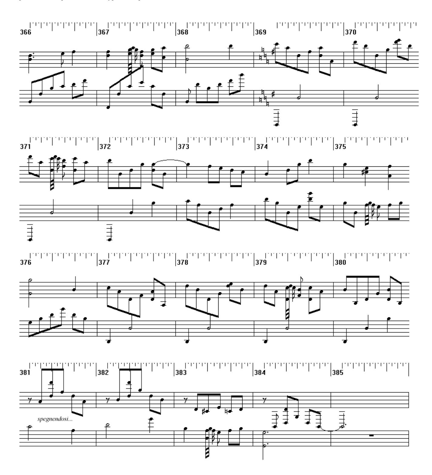
Scherzo da Capo.